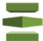
AWS Certificate Manager